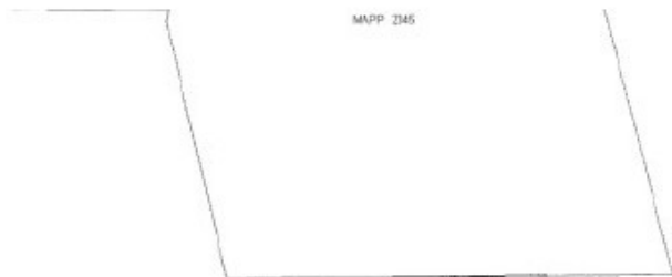
PIANO TERRA H= m 3,25